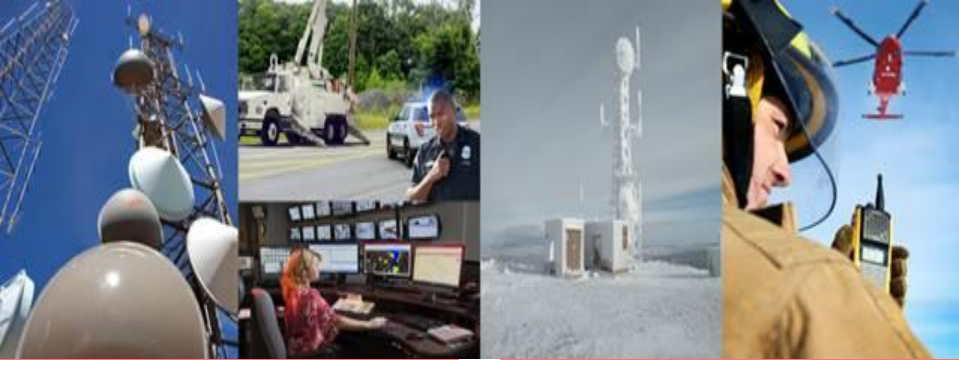
Use of U.S. DoD visual information does not imply or constitute DoD endorsement